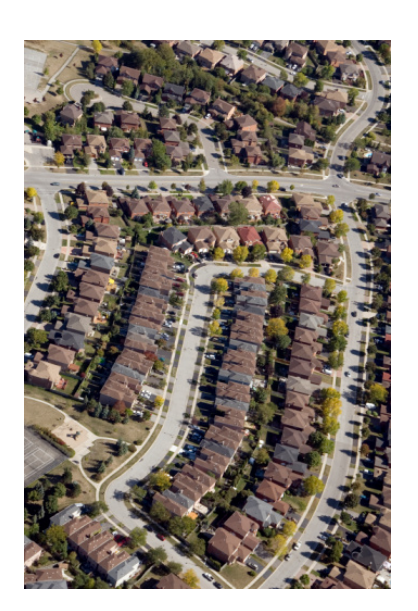
In the book An All-Consuming Century, Gary Cross defines consumerism as "the belief that goods give meaning to individuals and their roles in society." Consumerism defines our age and is reflected in the huge numbers of cars, electronic devices, fastfood meals, holiday trips, and myriad other goods and services that an increasing proportion of the world's population is driven to desire, acquire, and consume.

With population growth, increasing per capita consumption, and tremendous technological capacity leading to ever greater levels of production and consumption, we have begun to reach planetary limits, threatening the health and function of ecological systems that support all activity on Earth. Consider these facts: