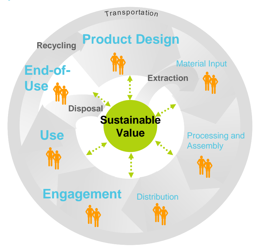
Figure 1. Opportunities to Address Sustainable Consumption in the Value Chain Cycle

Transformative progress depends on giving significantly greater attention to segments of the value chain cycle that have been overlooked in first-generation sustainability efforts. As depicted in the figure below, we see new opportunities to make significant advancements in sustainability through a heightened focus on product design , consumer engagement , use , and end-of-use elements of the value chain cycle. We refer to this as a "cycle" to reinforce the importance of thinking of these elements as part of single system, rather than simply as disconnected steps in a linear chain.