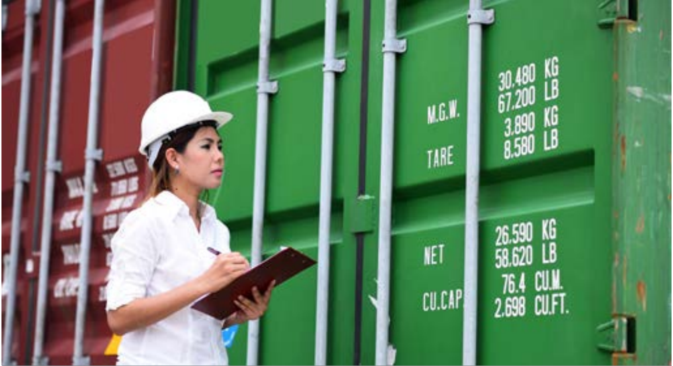
Dock worker in Bangkok, Thailand