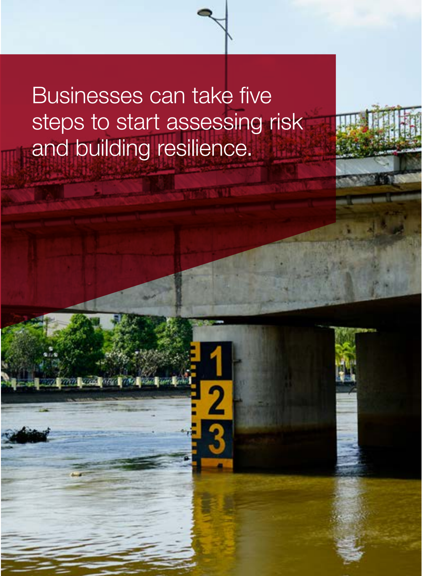
Depth meter in the Saigon River, Vietnam

Businesses can take five steps to start assessing risk and building resilience.